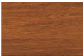
Coffee - dark colour